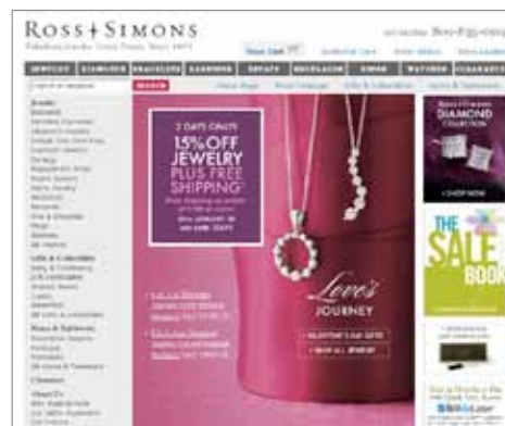
Ross-Simons ensures a superior shopping experience