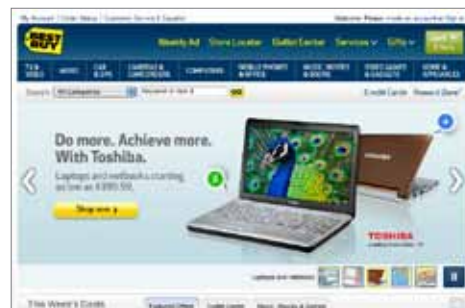
BestBuy accelerates dynamic transactional content