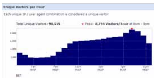
The Akamai Customer Portal provides Web content and visitor intelligence enabling deeper insight into your Web business.