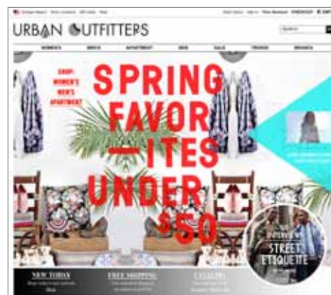
Urban Outfitters seamlessly handles traffic surges